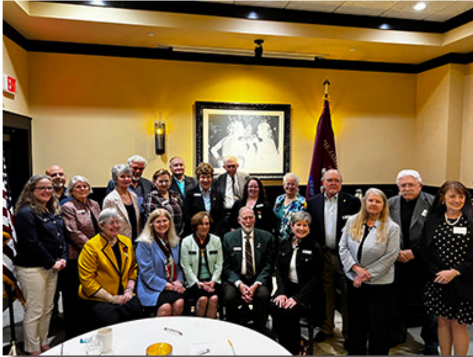
Spring Meeting-Annapolis, Maryland