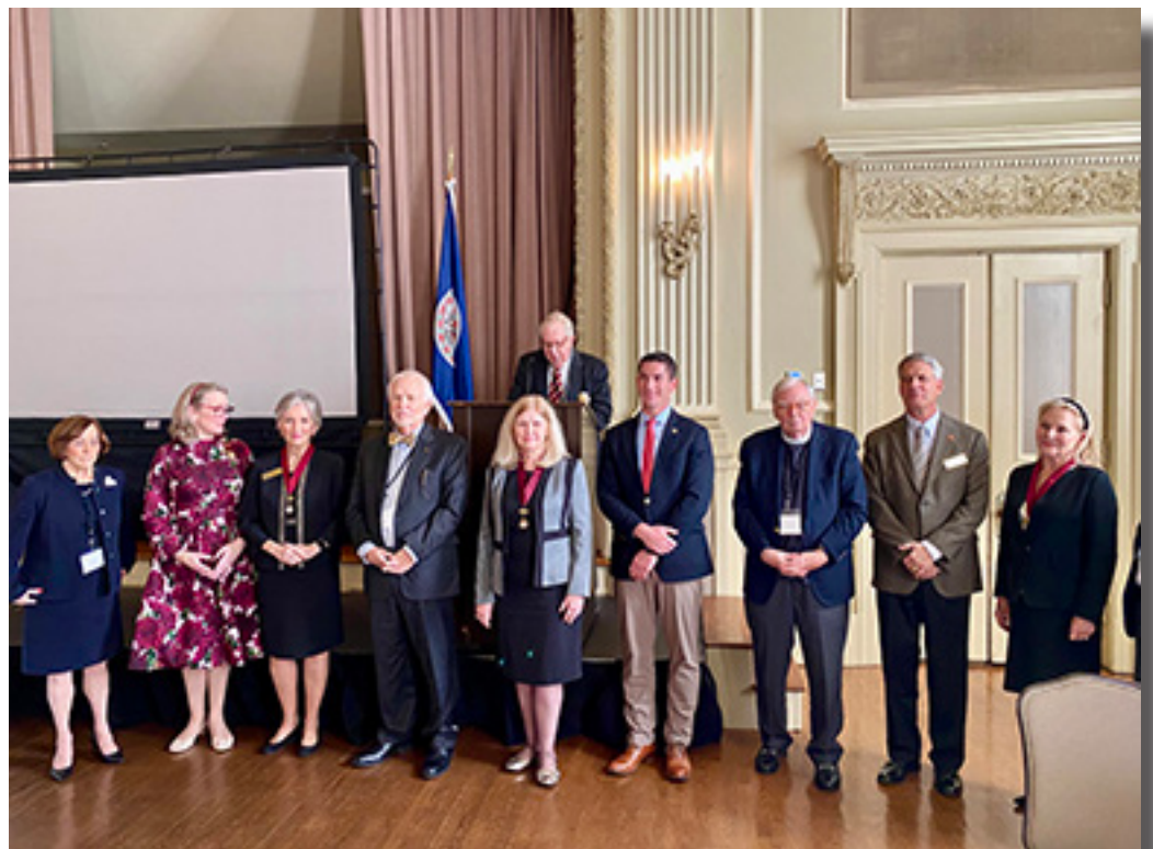
New Jamestown Society Officers, November 2024